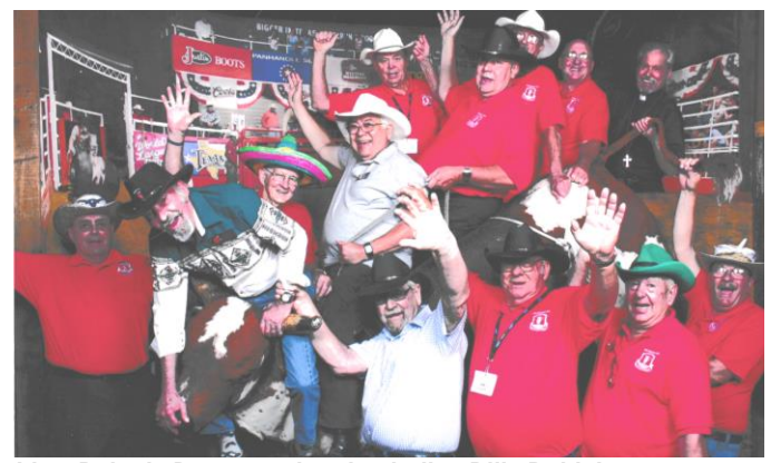
It's a Baker's Dozen taming that bull at Billy Bob's! And a good time was had by all!!!!!!!!!!!!! What more